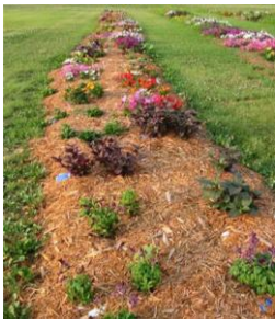
"Instant Bed"/No-Dig Garden www.motherearthnews.com

Hi everyone. The weather certainly is feeling more like spring a lot of the time. I am getting more urge to get out and get busy in the garden but wait.....it's still too early for tender frost sensitive plants like tomatoes and peppers. As we discussed last month this is the right time for cool weather crops like lettuce, spinach, peas, various greens like kale, chard and others. We did get snow peas, lettuce, kale and Swiss chard planted on