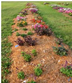
"Instant Bed"/No-Dig Garden www.motherearthnews.com

Hi everyone. The weather certainly is feeling more like spring a lot of the time. I am getting more urge to get out and get busy in the garden but wait.....it's still too early for tender frost sensitive plants like tomatoes and peppers. As we discussed last month this is the right time for cool weather crops like lettuce, spinach, peas, various greens like kale, chard and others. We did get snow peas, lettuce, kale and Swiss chard planted on