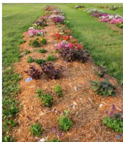
"Instant Bed"/No-Dig Garden www.motherearthnews.com

Hi everyone. The weather certainly is feeling more like spring a lot of the time. I am getting more urge to get out and get busy in the garden but wait.....it's still too early for tender frost sensitive plants like tomatoes and peppers. As we discussed last month this is the right time for cool weather crops like lettuce, spinach, peas, various greens like kale, chard and others. We did get snow peas, lettuce, kale and Swiss chard planted on