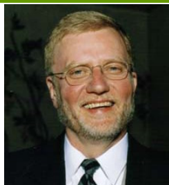
The Maple Center, Inc.

G reetings from The Maple Center! We are pleased and excited to send our first e-letter to you. Each month we hope to you keep you abreast of new programs and opportunities being offered at The Maple Center. Educational information and health-related programming are available at The Maple Center as well as integrative care and maternity care. If you prefer not to receive this e-letter, please notify us.